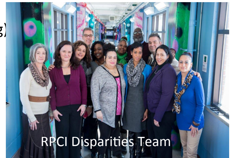
RPCI Disparities Team